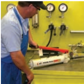
Hydraulic Pressure Test 10,000 psi