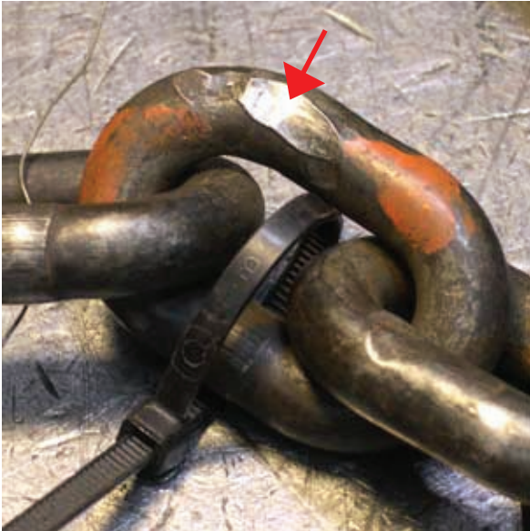
Each link must be inspected for damage and wear. Gouges and nicks of .005" are enough to scrap the chain (ASME B30.16).