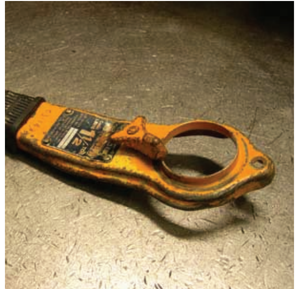
Bent handle assemblies can indicate operator abuse.