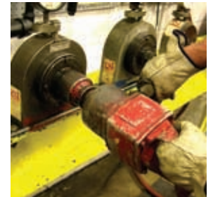
1" Impact Wrench on Skidmore