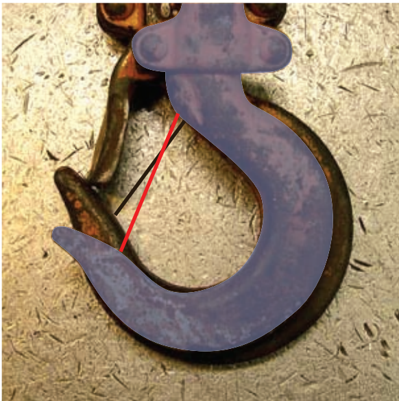
We measure each hook against the manufacturer's standards. Stretched hooks indicate the hoist has been overloaded.