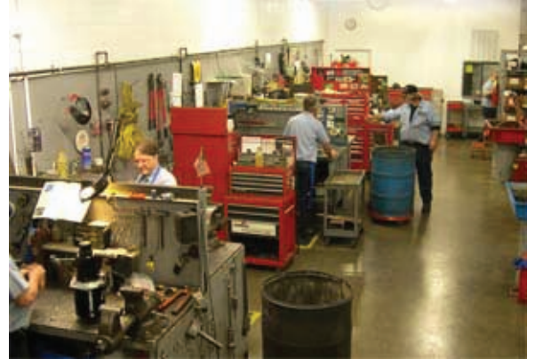
Newly Renovated Repair Shop

Zenmar's technicians have been Factory Authorized to repair most major brands of air tools, high pressure hydraulic pumps and cylinders, hoists and cumalongs. All tool and hoist repairs are repaired to manufacturer's specifications and load tested prior to leaving our facility to ASME/ OSHA specifications.