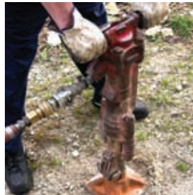
Pavement Breaker Load Test

Call us at 410.785.5790 for a pick up or give your broken tool(s) to your salesman during his next visit.