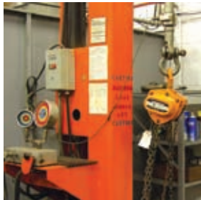
Chain Fall Load Tested to 125%