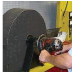
Air Grinder on Fan Blade Test